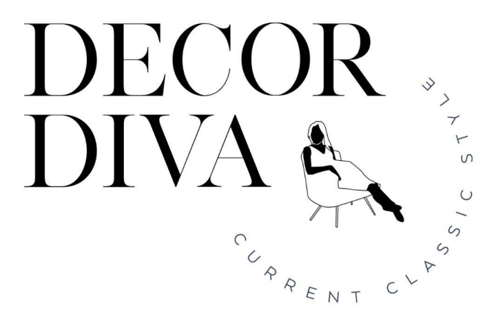
For all of your interior design dilemmas DECORDIVA.CA